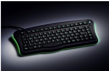
DS86W HL ▶

Here is a selection of similar keyboards. Are you interested in any of the following solutions? Just get in touch with us.