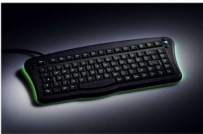
DS86W HL ▶

Here is a selection of similar keyboards. Are you interested in any of the following solutions? Just get in touch with us.